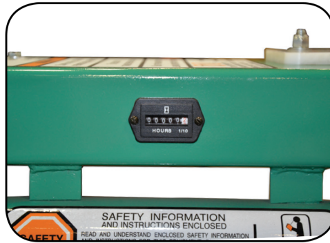
Hour meter for maintaining service intervals.