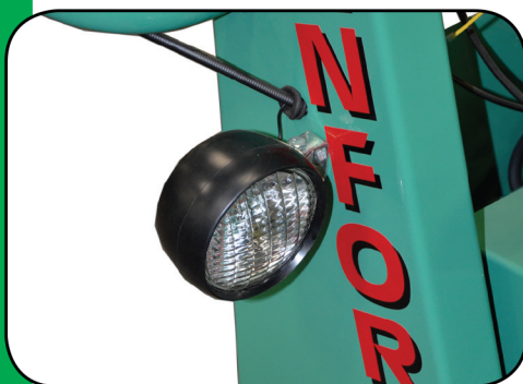
Standard headlight for extended working hours.