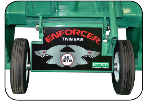
Tearoff width 25" in one pass.