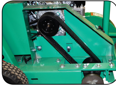
Rugged belt drive system with quick access panel.