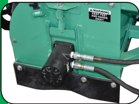
Heavy duty hydraulic broom drive.