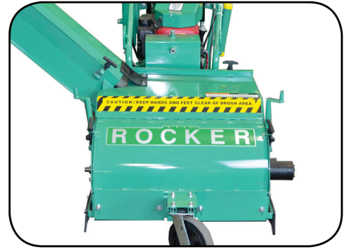
Front caster wheel for easy maneuvering. Screw jack adjustment of broom height.