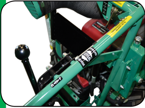
Smooth Hydrostatic drive with forward/reverse lever at handle for safety.