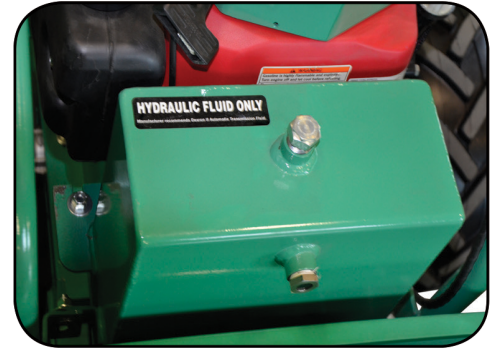
Large hydraulic tank with sight gauge.