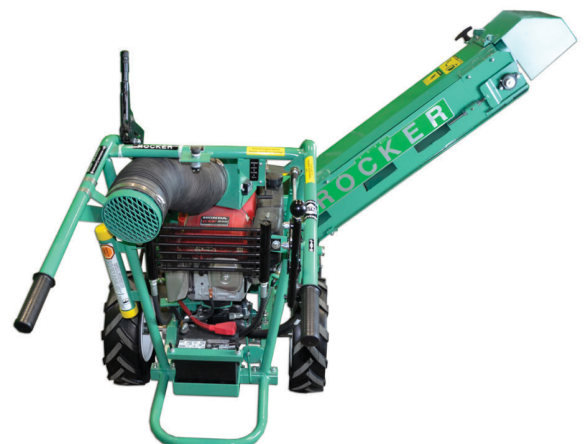
Operator Control Station

Flexibility: Remove many types of ballast, from pea gravel up to 2 ½ inch rock with the custom configuration options. Change configurations in just a few minutes.