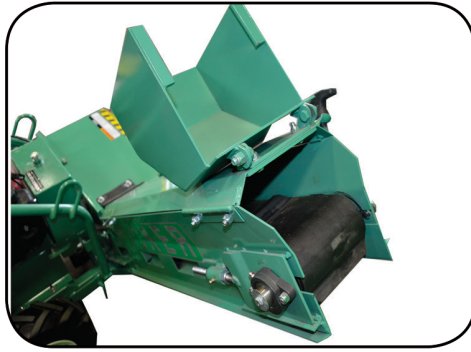
Rugged belt delivery system with access door.