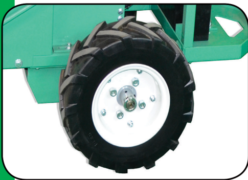
Flat-free solid tires for traction. (double-wheel hubs optional)