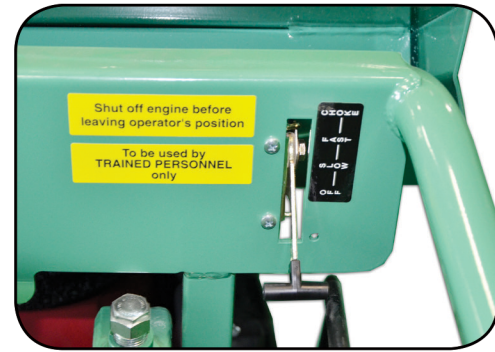
Engine electric start and throttle controls at easy reach.