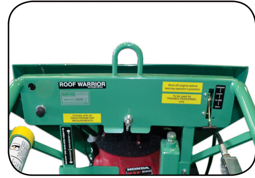
Integrated Lifting Hook.