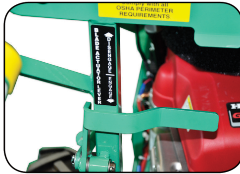
Rugged Blade engagement lever.