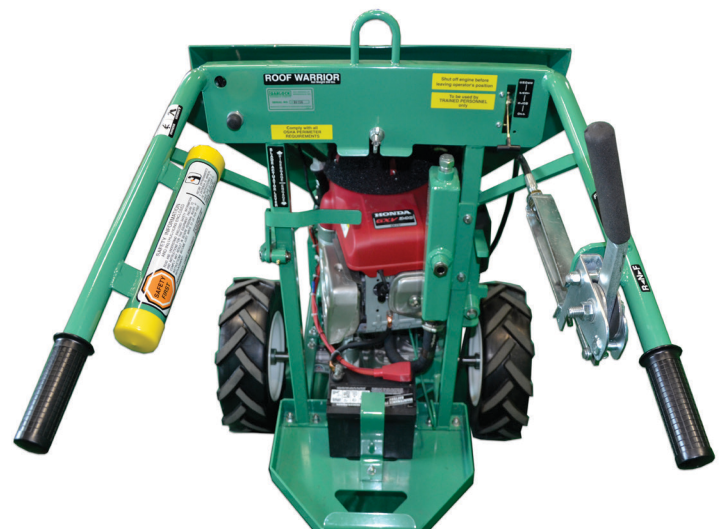
Operator Control Station

Increased Flexibility: Remove all types of material on roof deck surfaces with a portfolio of accessories, and attachments.