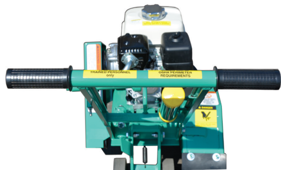
Operator Control Station

Simple and easy to use: Get started on projects sooner and spend less time training workers with the simple push down handle scraping activated system.