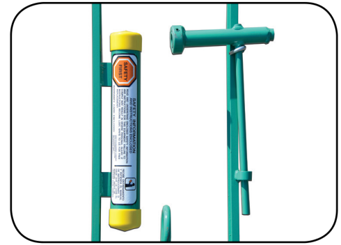
Integrated tool storage and manual holder.