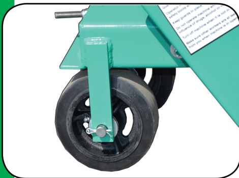
Flat-free solid rubber tires.