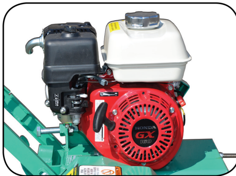
5.5 Hp HONDA Engine powered.