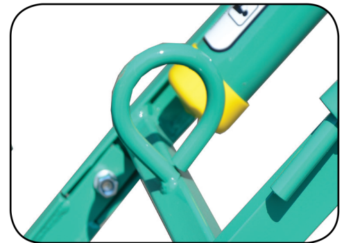
Integrated Lifting Hook.