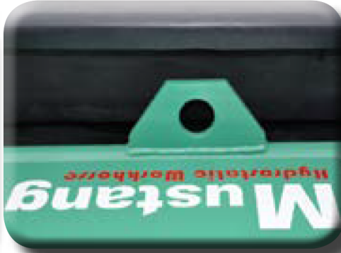
Integrated lifting point.