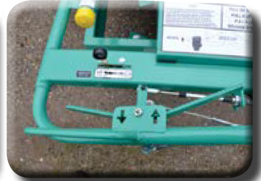
Improved ergonomics on forward and reverse controls.