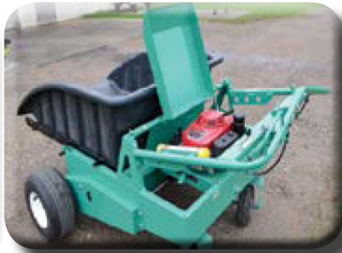
Flip up engine cover provides protection and easy access to Honda Powerplant.