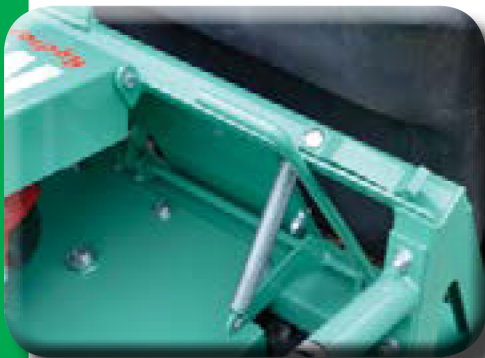
Quick release handle for accessories such as dump for Tuff-Tray.