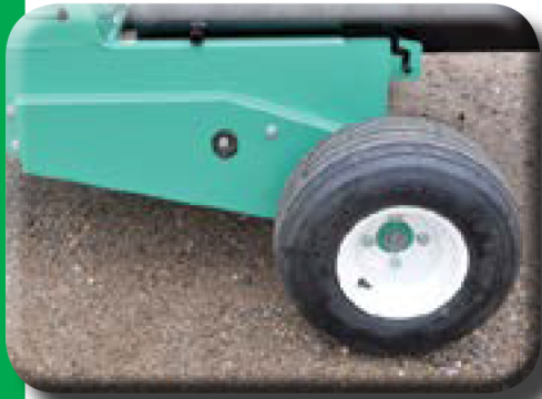
Upgraded hydrostatic transmission drive system.