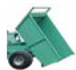
36 cu ft. Hopper