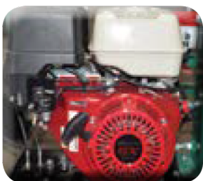
Reliable Honda Power