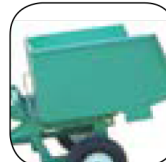
30" deep dump