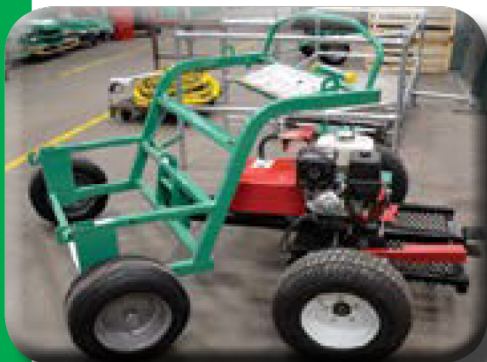
Improved turning radius