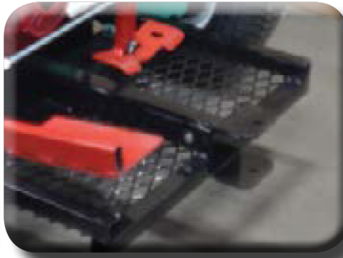
Pin or 2" Receiver port for towing