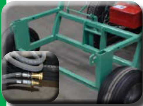
Tool-Free installation of attachments