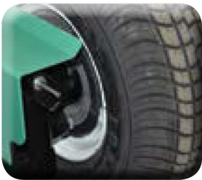
Improved disc brakes