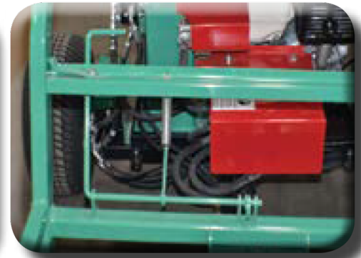
Easy operating latch for dump bins