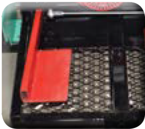
Brake engages with no driver